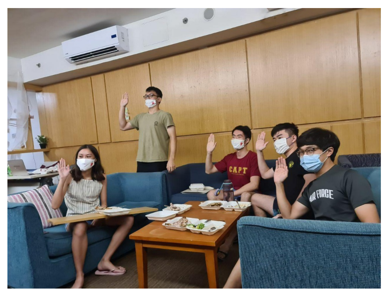
E-WELCOME BACK DINNER

This year's dinner may have been held over Zoom, but that did not stop CAPTains from "dressing up" for the event. CAPTains gathered in zones to enjoy food and drink together from the comfort of their own rooms (or lounges).