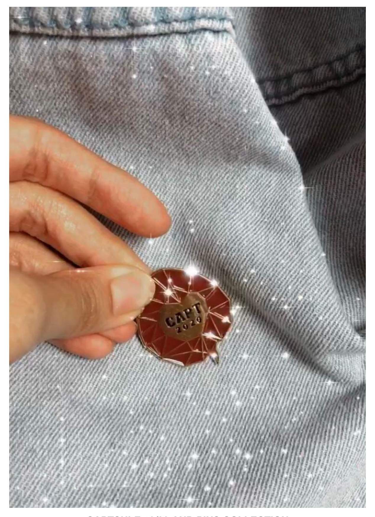
CAPTSULE 19/20 AND PINS COLLECTION

Over the span of 3 days, CAPTains from AY19/20 across came down to the various collection points to receive their CAPT pins and yearbooks designed by