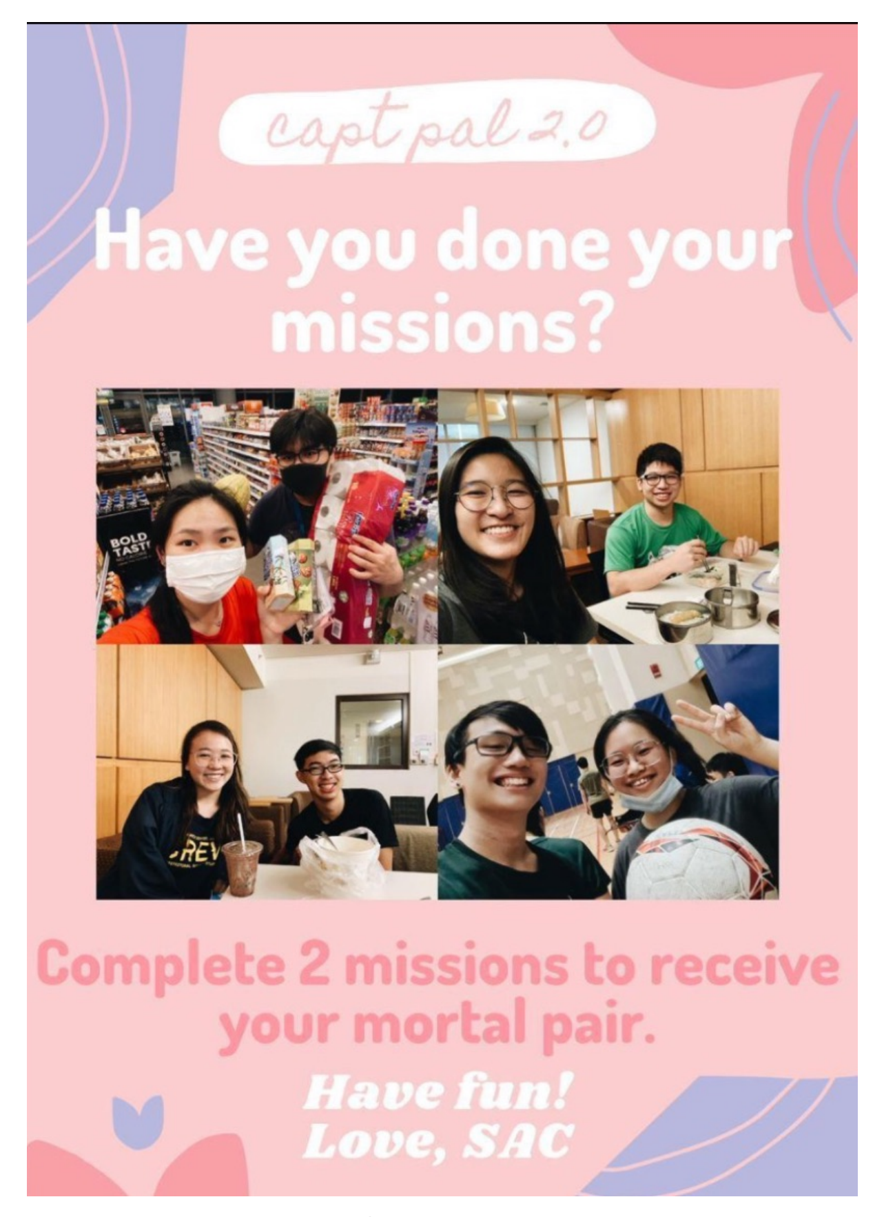
CAPT PAL 2.0

Organised by the Student Affairs Committee (SAC), CAPT Pal 2.0 is an extension of CAPT e-FOC's CAPT Pal, where freshmen are paired with