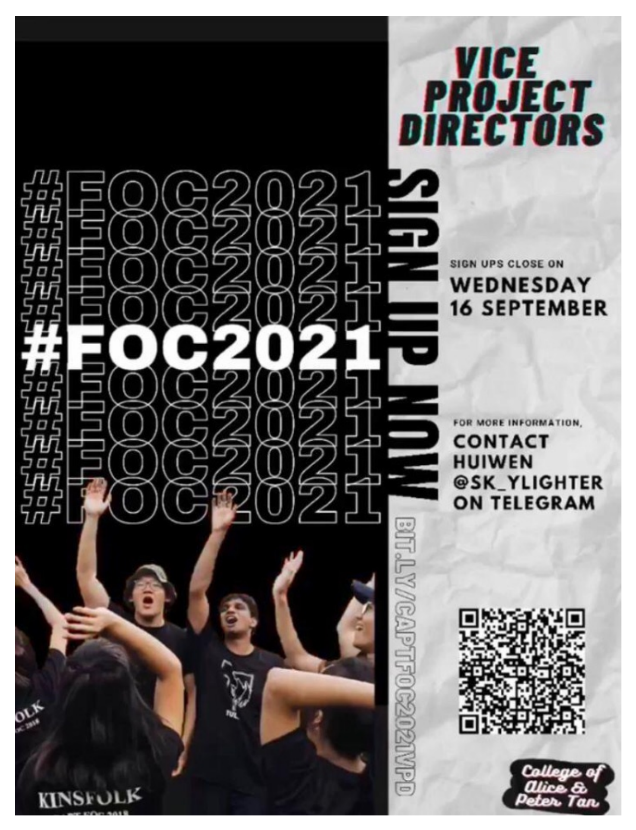
FOC 2020 VICE-PROJECT DIRECTOR RECRUITMENT

The Freshman Orientation Camp 2020 is recruiting for Vice Project Directors. CAPTains who are interested in planning an exciting orientation for the batch of CAPTains, seize this opportunity to make a difference.